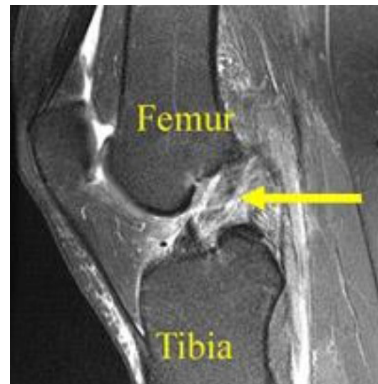
An MRI of a complete ACL tear. The ACL fibers have been disrupted and the ACL appears wavy in appearance [yellow arrow].

If the ACL is torn, the examiner will feel increased forward (upward or anterior) movement of the tibia in relation to the femur (especially when compared to the normal leg) and a soft, mushy endpoint (because the ACL is torn) when this movement ends.