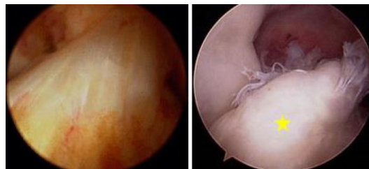
(Left) Arthroscopic picture of the normal ACL. (Right) Arthroscopic picture of torn ACL [yellow star].