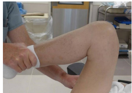
To break down scar tissue, your doctor may perform manipulation under anesthesia.

In this procedure, you are given anesthesia so that you do not feel pain. The doctor then aggressively bends your knee in an attempt to break down the scar tissue. In most cases, this procedure is successful in improving range of motion. Sometimes, however, the knee remains stiff. If extensive scar tissue or the position of the components in your knee is limiting your range of motion, revision surgery may be needed.